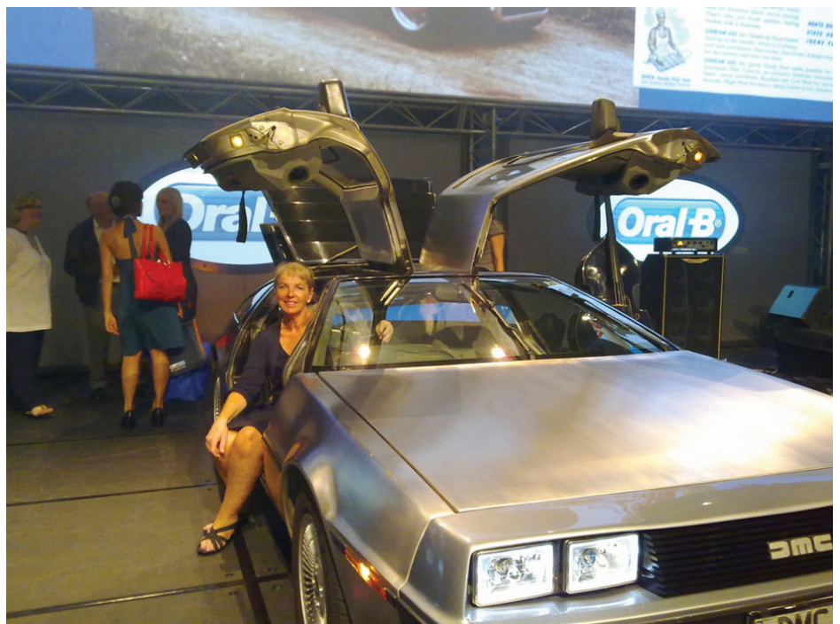
Brisbane Congress March 2011: The Oral B theme 'Back to the Future' and the President in the DeLorean.