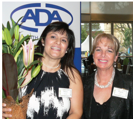
Past Presidents Reception