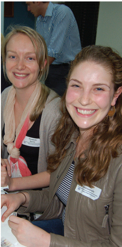
Rotary Endodontics Evening