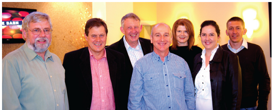
Limestone Coast Seminar