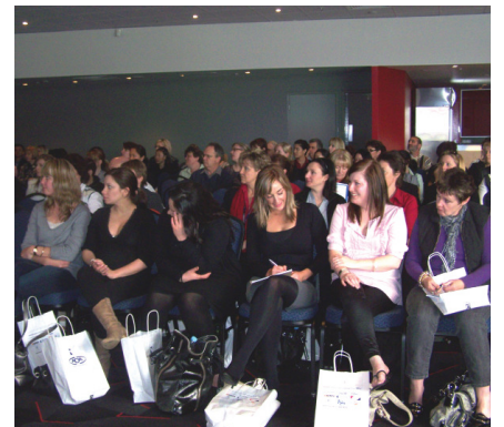
Infection Control Seminar