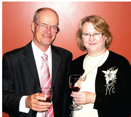
May Branch Meeting