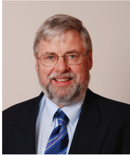
Dr Karin Alexander Federal Councillor

The treasurer reported an operating profit for 2009 - 2010 of $46,347 and an overall profit of $358,039 after rental and investment income was added. The result for the first quarter of 2010-2011 was good with income 2% above and operating expenses 8% below budget. The investment portfolio was performing reasonably well and a reserves policy was circulated which allowed for the working capital and general