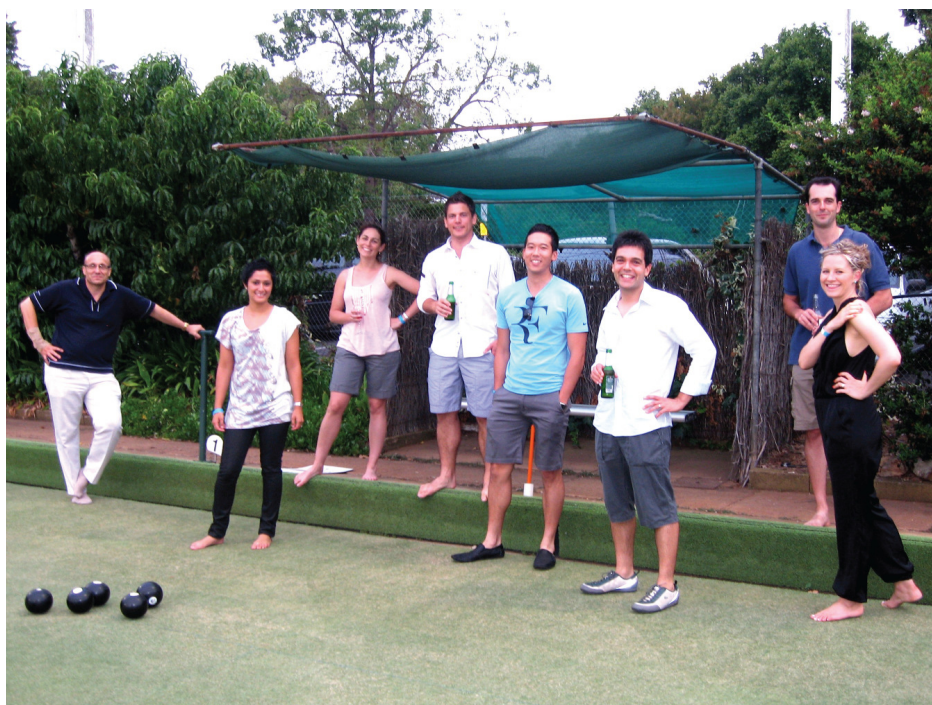
Participants at Lawn Bowls Evening, February 2011

Our involvement with the students extended to other events such as the Learn from Our Experience evening in September, kindly sponsored by the ADASA. A panel of dentists shared their experiences to the final year dental students. Topics included discussions about contracts, sitting the Primary Examinations, working in the private sector/public sector/rural, specialising and dentistry from a new graduate's perspective. The students were presented with a graduation pack detailing the procedures including all the necessary paperwork required to register as a dentist. In addition to this, the September issue of Dental Insights once again provided an Employer's Guide, incorporating a majority of the 2011 graduating